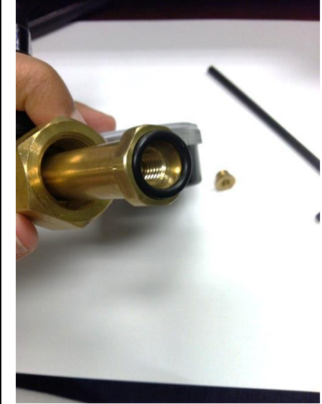
Gently pry the ring up and out of the recessed space in the nipple.