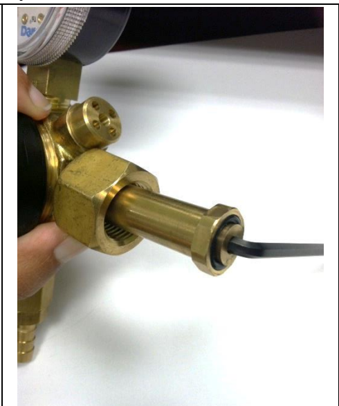
Use a 5/32" hex key to remove the retainer and gain access to the ring.