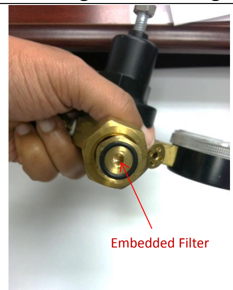
Note that the internal filter should remain in place during replacement.