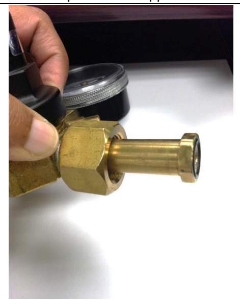
The tightened retainer will sit just below the top of both the O-ring or flat ring and the outer brass lip.