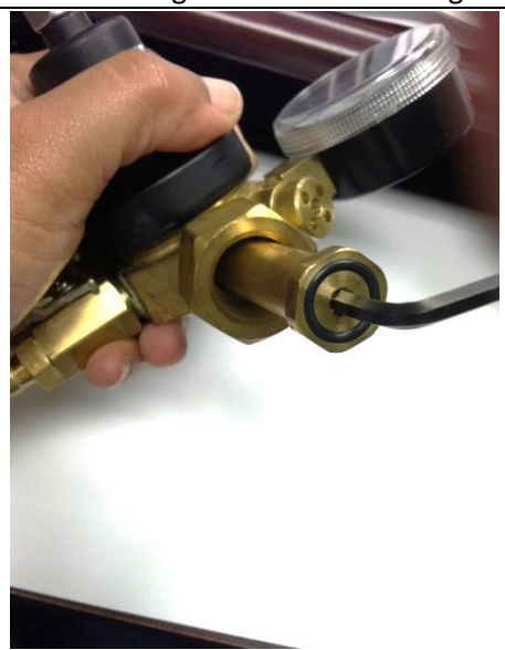
Retighten the retainer completely to prevent CO<sub>2</sub> leaks.