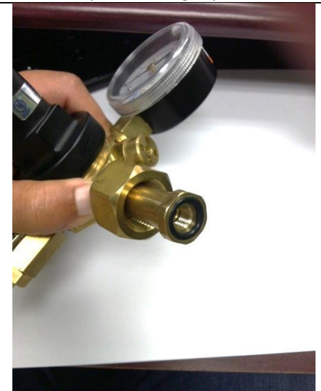
Seat the new or cleaned ring fully into the recessed space. Invert reused rings before installing. The fit will be snug.