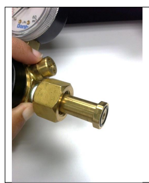
Taprite inlet nipple O-rings and flat rings can be easily replaced.